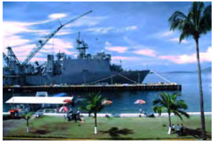
Left photo: Exploding car: Ambush scene on Dewey Avenue in front of SBMA Chapel for “Goodbye America”.

The tragedy of 9/11 put an end to much international filmmaking in the Philippines. While the dream of Subic Bay becoming