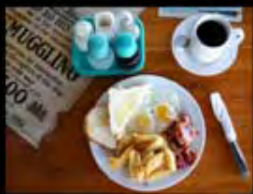
Top photos (clockwise): Dryden's, By The Sea, Vasco's & VFW 11447 Canteen Bottom photos (clockwise): Johan's Adventure & Wreck Dive Center, Aresi's Restaurant, Hungry Marlin & Playa Papagayo